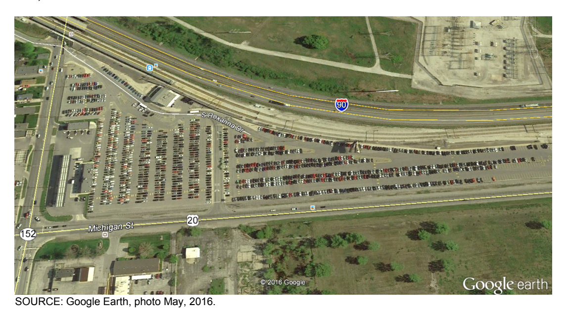
Figure 1.2-2: East Chicago Station Parking Use, 2013

Limited transit options for Study Area residents are causing the nearest existing transit stations to experience parking conditions at or near capacity. An example of this condition is seen at the existing SSL East Chicago Station (see Figure 1.2-2 ). This facility is largely land-locked, and the local road network used to access the site is congested. Considering that 90 percent of SSL riders use a parkand-ride to access stations, Study Area riders would be impacted by constrained parking at existing SSL stations, and would benefit from facilities in their home communities.