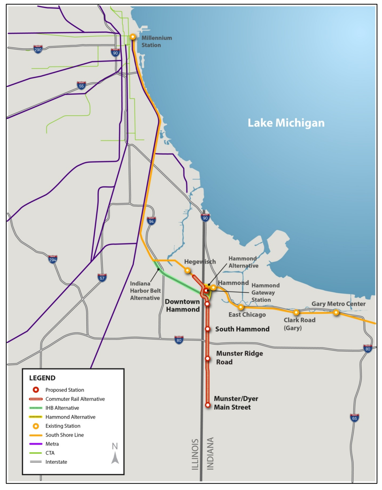
Figure 1.1-1: Regional Setting for West Lake Corridor Project