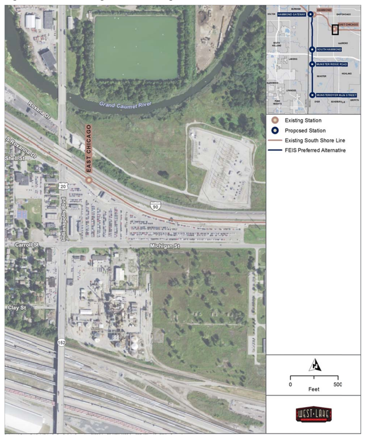
Figure 1.2-2: East Chicago Station Parking, 2016